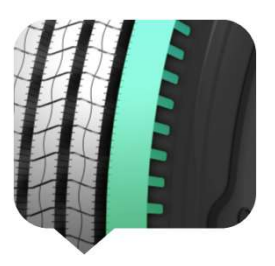
NOTCHED SHOULDERS WEAR RESISTANCE